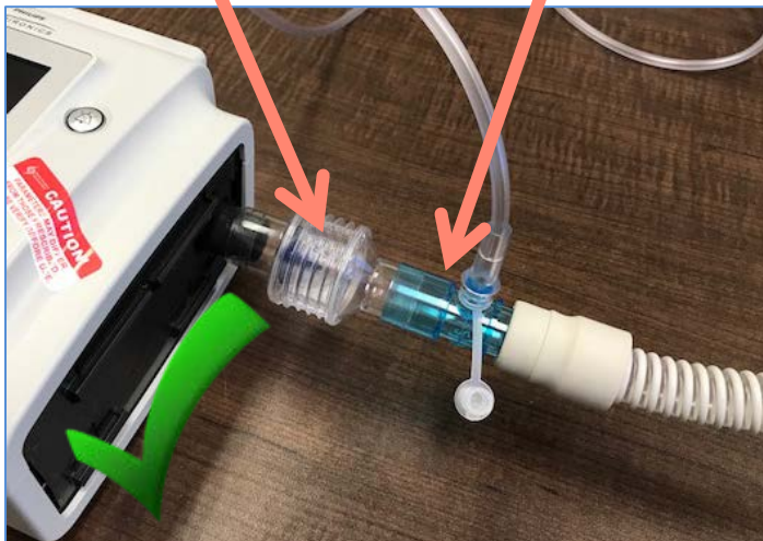
Oxygen Adapter AirLife Cat. 004081

Oxygen therapy may be used with the BiPAP A40™.